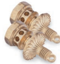
3 Front / Back Working Driven Tools: Eccentric drilling / tapping